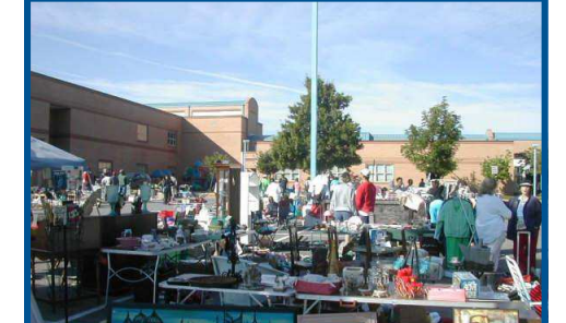
Saturday June 7, 8-3. The Place To Be!

The Foundation's goal is to direct $100,000 to YOUR hospital in 2014. You can help reach this incredible goal. Donate, hold an event, make a Planned Gift, support Grape Escape, Radio-thon, the Christmas Campaign or make a gift from your estate.