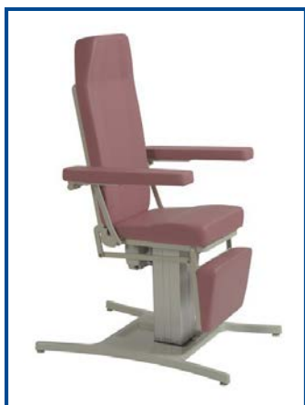
New Phlebotomy Chair

Part of the $122,0000 spent on the Durham Hospital Lab in 2014 went towards the purchase of a new phlebotomy chair. When you need to have blood drawn for lab tests, you will get to sit in this brand new, very comfortable reclining chair.