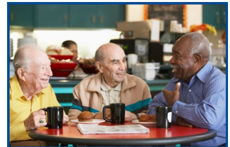
Men's and Women's Health Chats

Displays were set up in the Link and refreshments were served at both Chats. The Health Chats will be returning in 2015.