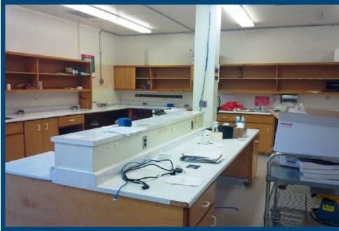
The old lab, with old wood cabinetry and chipped counters.