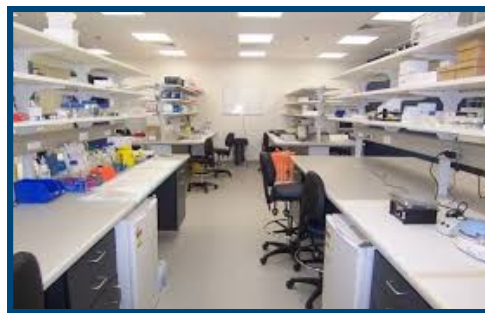
How the new lab will look, sterile, bright and efficient.

The Durham Hospital laboratory has not seen any improvements since the mid 1960's and is due for an upgrade.